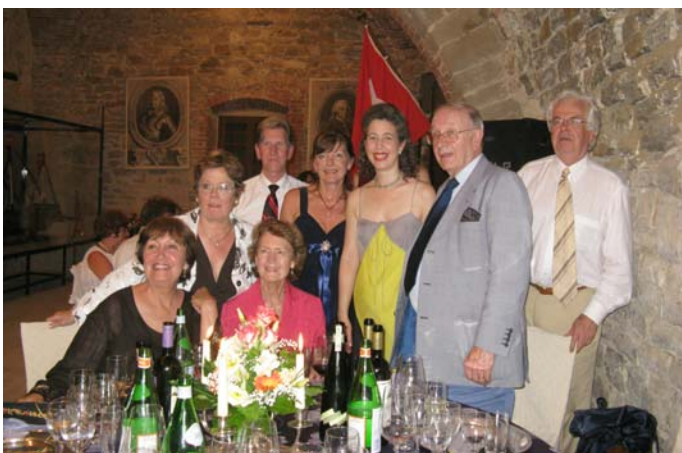
< Pauwels tour members meet Angela Hewitt during a gala dinner, June 2008