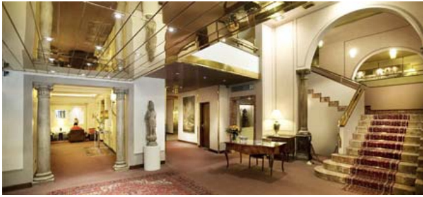
< The lobby of Hotel Accademia

Piazza delle Erbe, the huge castle, and the impressive tombs of the Scaligeri Family, rulers of Verona during the Middle Ages. Welcome dinner in the restaurant of our hotel or a nearby restaurant.