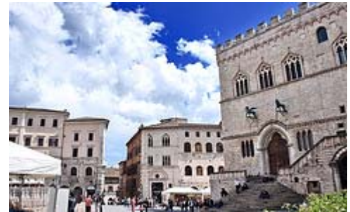
A piazza in Perugia