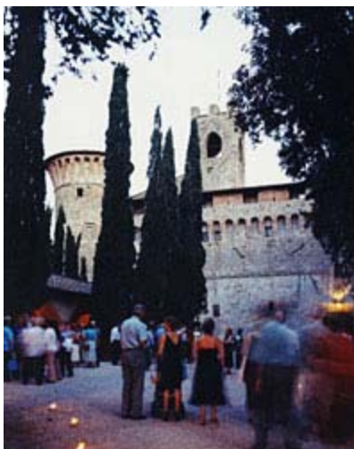
Off to a concert of the Trasimeno Festival in the Castle of the Knights of Malta in Magione!

Pauwels Travel Bureau Ltd. 95 Dalhousie Street, Brantford, Ontario N3T 2J1 Tel: 519-753-2695 / 519-756-4900 Fax: 519-753-6376 tours@pauwelstravel.com - www.pauwelstravel.com